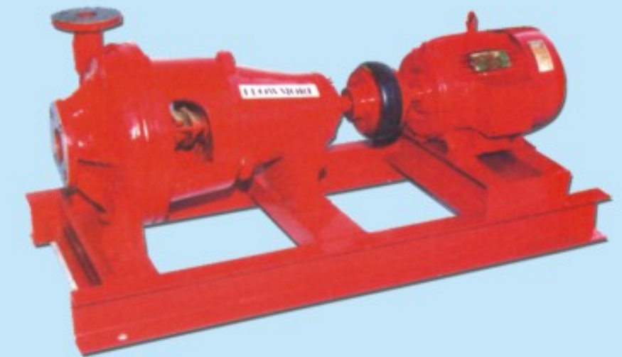
End Suction Fire Pump