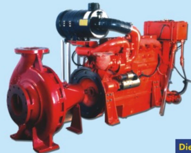
Diesel Engine Driven Fire Pump